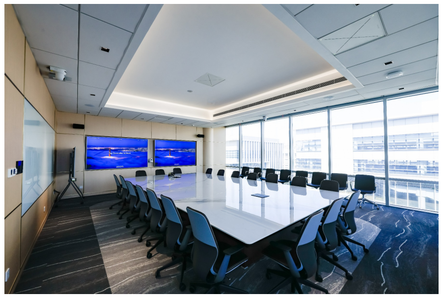
With the installation of 116 units of TCC 2 throughout the campus, the university ensured that every space could benefit from the Trusted Sennheiser Audio Quality

the-art audio technology, brand agnostic integration, and a proven track record of successful global applications. With the installation of 116 units of TCC 2 throughout the campus, the university ensured that every space could benefit from the Trusted Sennheiser Audio Quality.