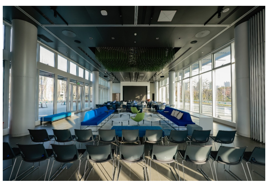
TCC 2's TruVoicelift functionality guarantees that everyone's voice can be heard clearly from every corner of the room, without any distortion or delays